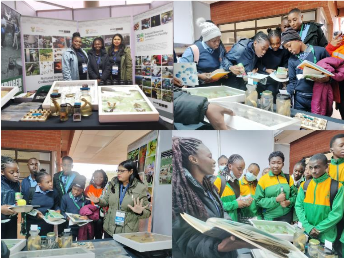
NSCF Exhibition stall at National Science Week Launch