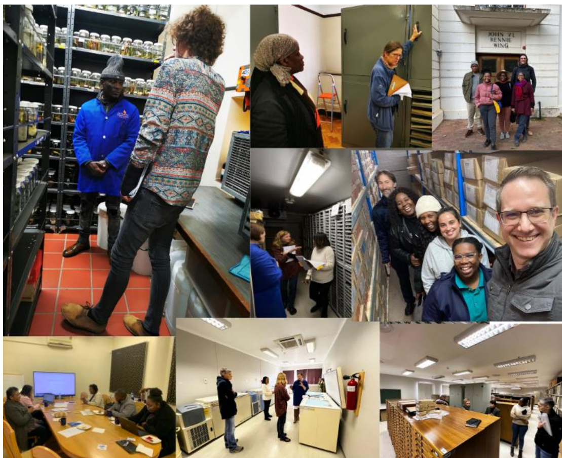
NSCF Hub staff and collections staff conducting collections assessments